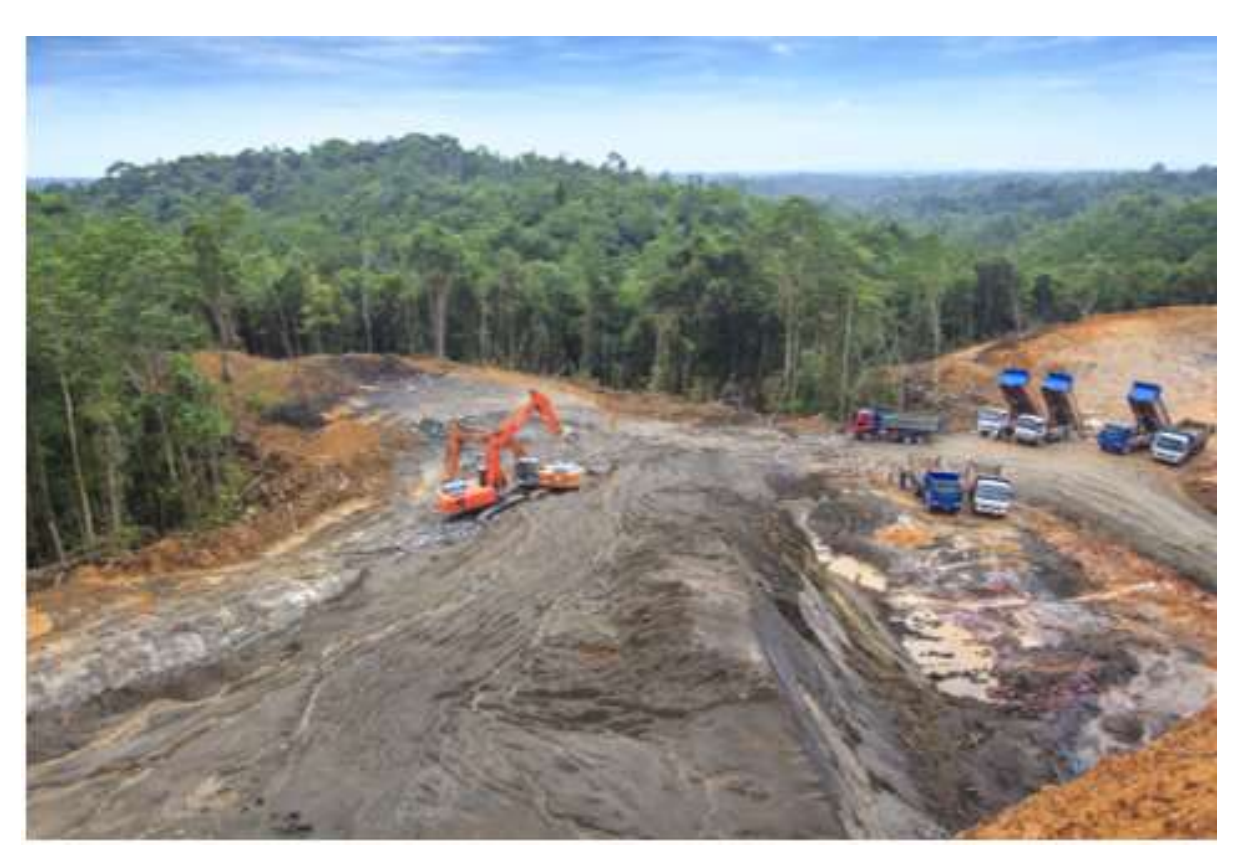
Kuching, Malaysia – 16 MAY 2015. Deforestation. Photo of tropical rain forest in Borneo being destroyed to make way for oil palm plantation.

companies' adverse climate impacts or their responses. Net zero targets have been used to maintain the status quo rather than take effective action against climate change.<sup>103</sup> Provision on climate impacts will also need to account for future scientific developments.