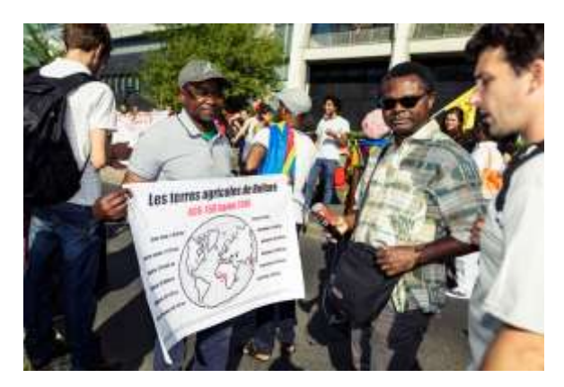
Paris, France. 1 June 2017. Several dozens of activists gathered outside the headquarters of Bolloré, where the annual Board of Directors meeting was held to protest against the irresponsible exploitation of industrial plantations in several African countries.

after the Socfin Group refused to independently audit its operations and failed to fully comply with the remediation plan that had been agreed to in 2013.<sup>138</sup>